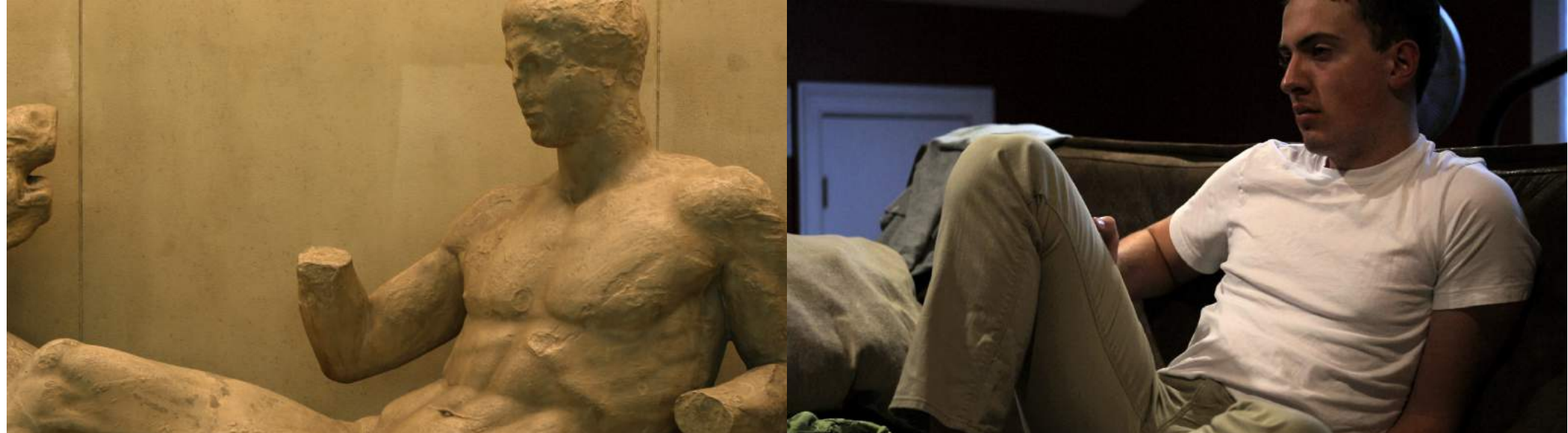
Searching the Original 2016

HDV, color, sound, 32'43" (video stills)